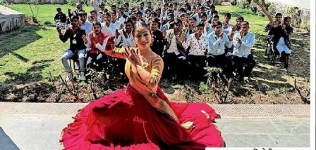
झालावाड़, प्रस्तुति देती कलाकार।

झालावाड़ सिक् मैके की कार्यवाही और प्रस्तुतिकरण कार्यक्रम के तहत आईडीआई संस्थान खानपुर और रक्तकोष उच्च माध्यमिक विद्यालय कोटा में राहनीय नृत्य कार्यक्रम की प्रस्तुति हुई।